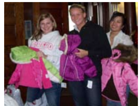
The Christ Child Society continued their generous contribution of new coats for all children in need.