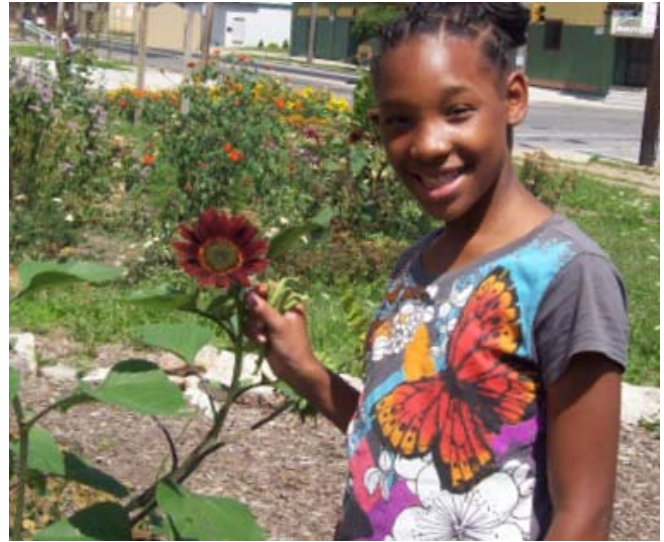
One of our "Emerging Young Ladies" admires a Mexican Sunflower in the Ujima Park and Garden.

The young ladies also saw the premier viewing of "Losing Maria" a Toledo-made movie about a young woman recruited into commercial sex trafficking. The girls continue to meet and are planning an 'Un-haunted Halloween' party on October 24 at 6:00-7:00 PM. Several college women are mentoring the young ladies. Monthly gatherings, outings, and just plain 'having fun' are in the plans.