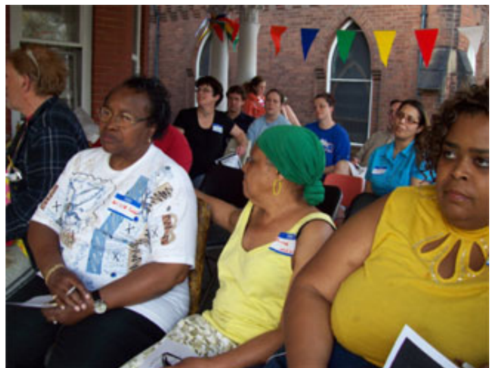
Community members and Brighten Up staff listen as issues surface.