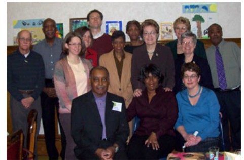
Other Padua Promoters, board members, staff and friends of Padua Center flank Congresswoman Kaptur.

Padua Center was spic and span, the kitchen was emitting smells of scrambled eggs and homemade muffins, and the PowerPoint presentation was ready as staff and volunteers eagerly welcomed Congresswoman Marcy Kaptur, for a visit. Because of a last minute change of timing, so that Kaptur could return to Washington for the historic vote on the Health Care Reform Bill, not everyone invited attended the 7:30 AM gathering. But, those who present engaged in the activities of The Padua Center and in making connections.